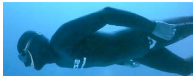
Ed Packhem wanna be.

SPECIAL NOTICE Our August 10th OCA meeting will be held at Corrine's, just south of the Home Depot Plaza on route 1A in Pawtucket. A buffet dinner will be served at $15.00 per person. Beware: no left turn heading south during commuter hours.