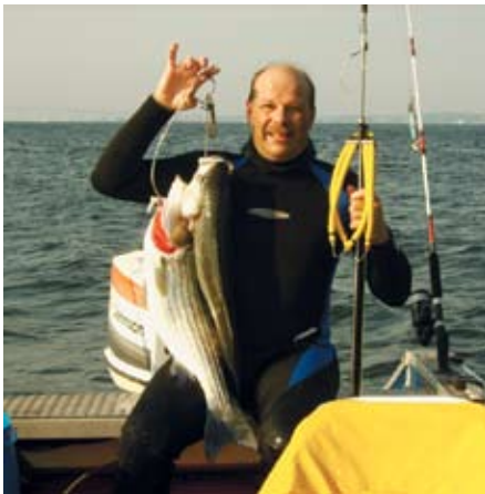
Ian: I'm getting sick of writing captions. How 'bout some really big fish?!?