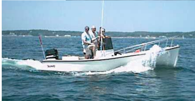
A distant memory...August!