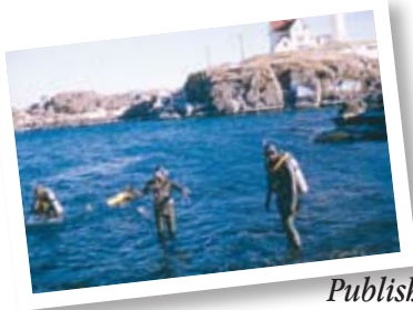
OCA divers at Nubble Light in Maine, January, 1969.